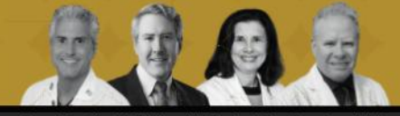
Board Certified & Fellowship Trained Eye Care Specialists